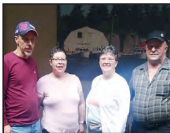
HEARTFELT BLUEGRASS (PEI)