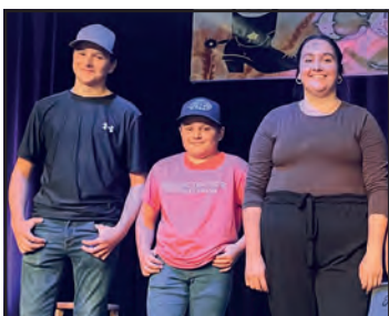
JEUNES MUSIENS ÉVANGÉLINE (PEI)