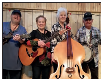
SK BLUEGRASS (PEI)