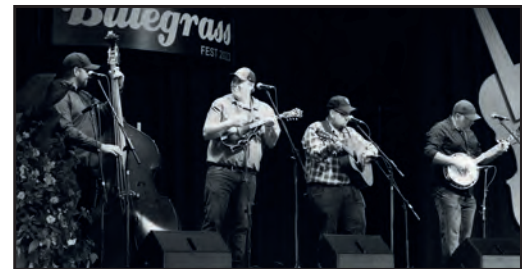
HIGH RIVER (NB)