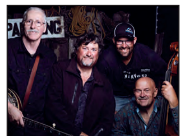
BLUEGRASS DIAMONDS (NB)