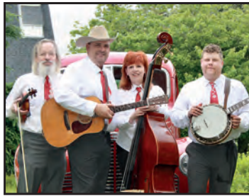
BLUEGRASS TRADITION (NS)