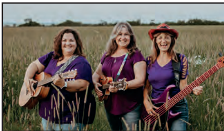
TREBLE MAKERS (PEI)